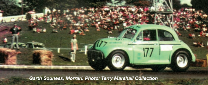
Garth Souness, Morrari.